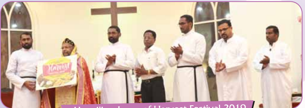
Unveiling Logo of Harvest Festival 2019