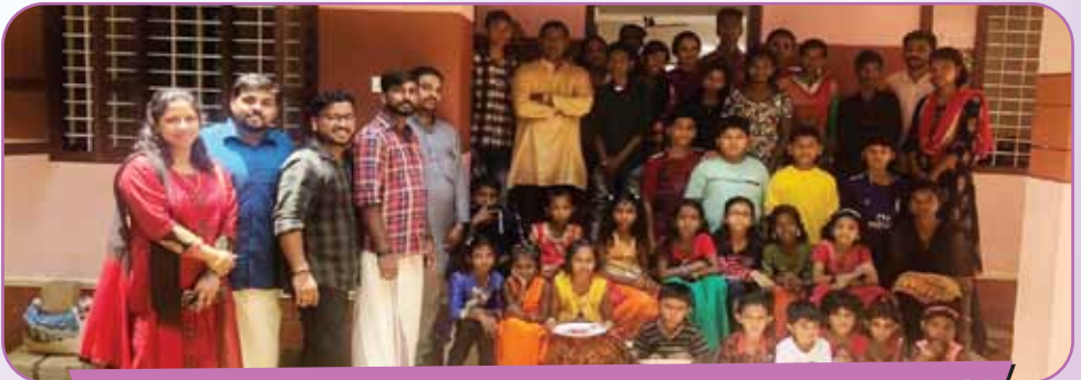
Yuvajana Sakhyam-Onam Celebrations-Uppukuzhi Mission Field