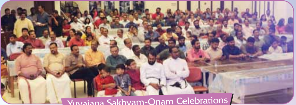
Yuvajana Sakhyam-Onam Celebrations