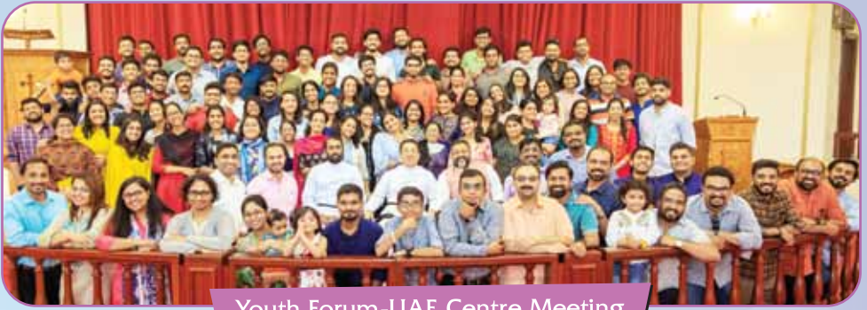
Youth Forum-UAE Centre Meeting