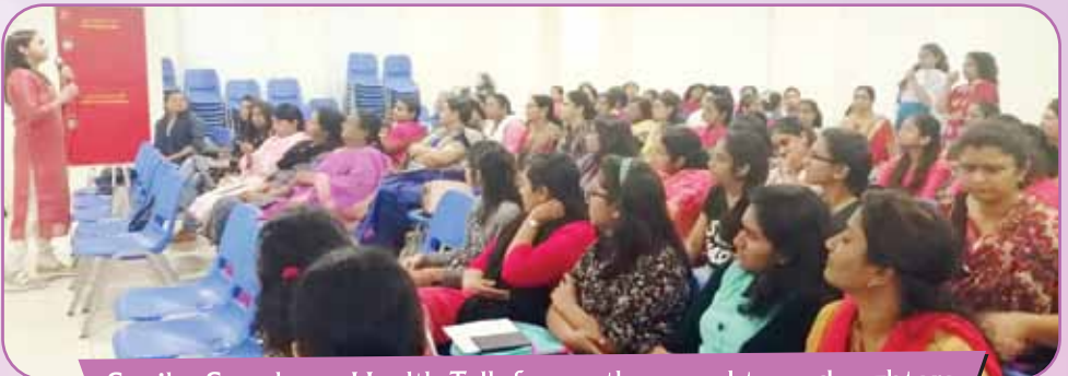
Sevika Sanghom-Health Talk for mothers and teen daughters