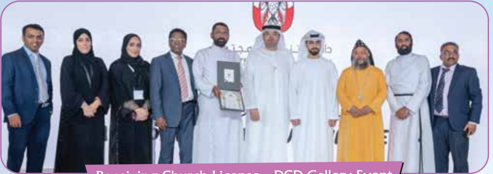
Receiving Church License - DCD Gallery Event