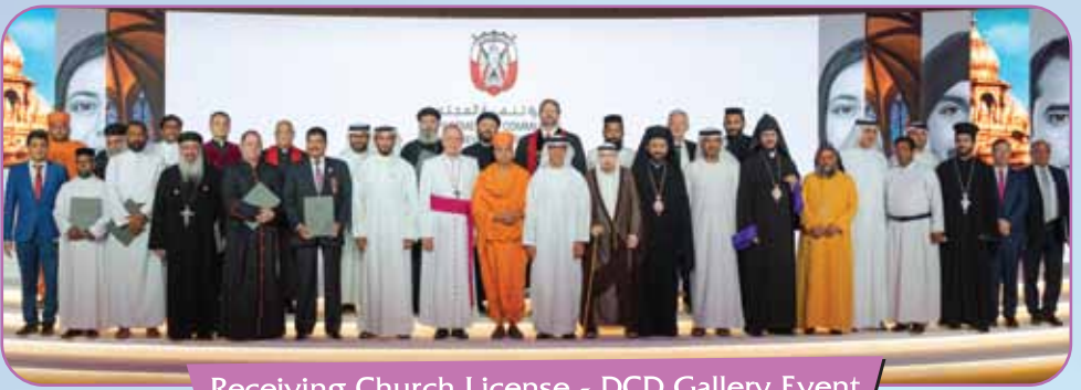
Receiving Church License - DCD Gallery Event